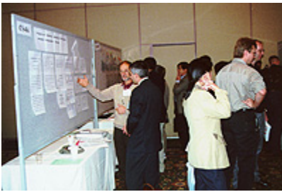
A poster session at the conference.