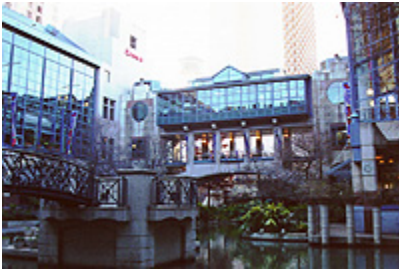
The San Antonio River and the surrounding stores, restaurants and hotels.